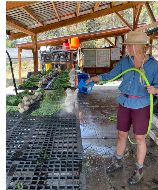
Seed to Table vegetable harvest

Ulysses can assist with case management and information and referral services to help Spanish-speaking seniors and their loved ones access the resources they need.